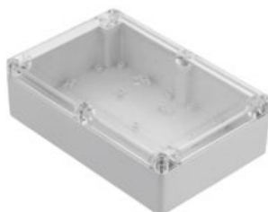
ZP210.140.60 hermetic enclosure