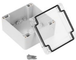
ZP105.105.60S hermetic enclosure with a gasket