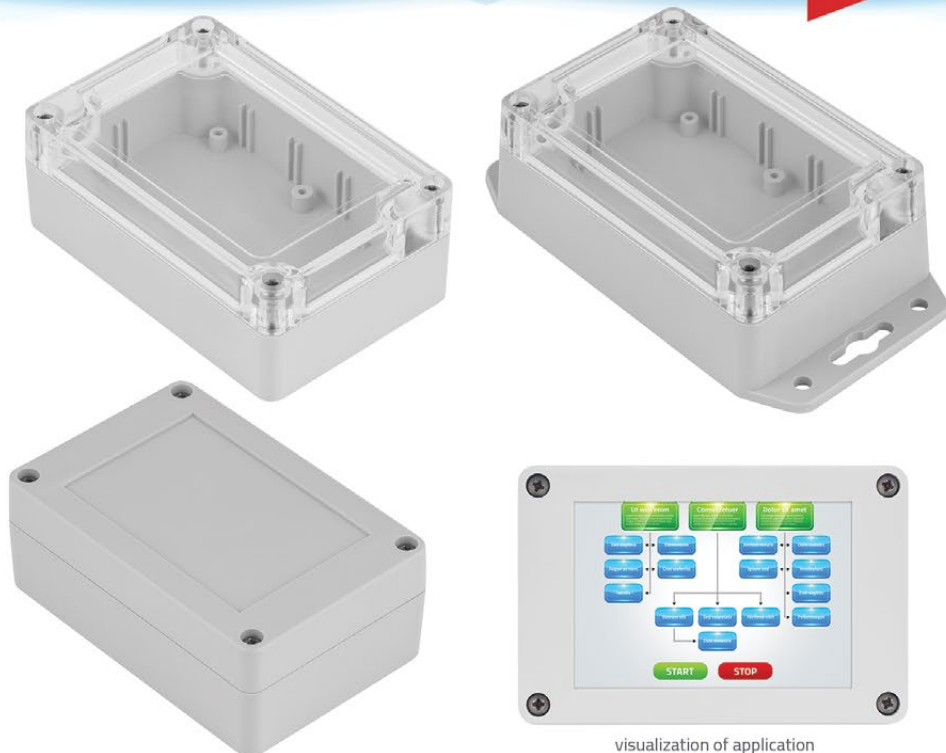
visualization of application

SOON THE PRODUCT WILL ALSO BE AVAILABLE IN A VERSION WITH A CAST GASKET